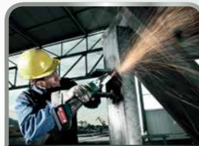
Cutting and Grinding