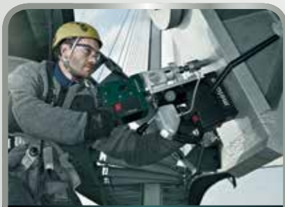
Drilling and Screwing

We focus on the application areas of mechanical engineering, shipyards, exploitation of raw materials/energy at sea (oil platforms/wind parks), refineries, wind energy, special vehicle engineering, pipeline construction and power stations.