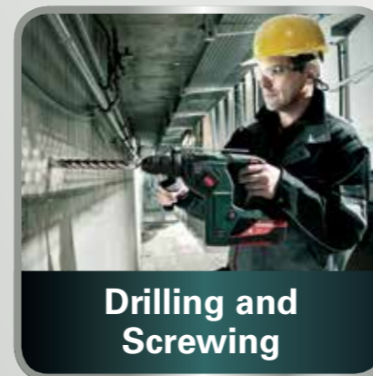
Drilling and Screwing

Here we focus on the application areas of roof and timber construction, window construction, wall and facade, drywall construction, installation, laying of floors and tiles, and garden and landscaping.