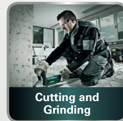
Cutting and Grinding